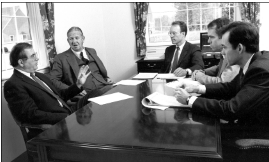
Lumbard Investment Counseling’s advisory board, in 1990

Given enough time, we can shift all of the world’s vehicles to electric power, recharged by nuclear, coal, solar, and wind. Or we can shift all of the world’s vehicles to diesel fuel derived from coal. Or we can shift most of them to biodiesel, and most of the rest to natural gas. Even ethanol might have a role; switchgrass-based ethanol for the general public, and corn-based moonshine for lobbyists and corn-belt congressmen . . .